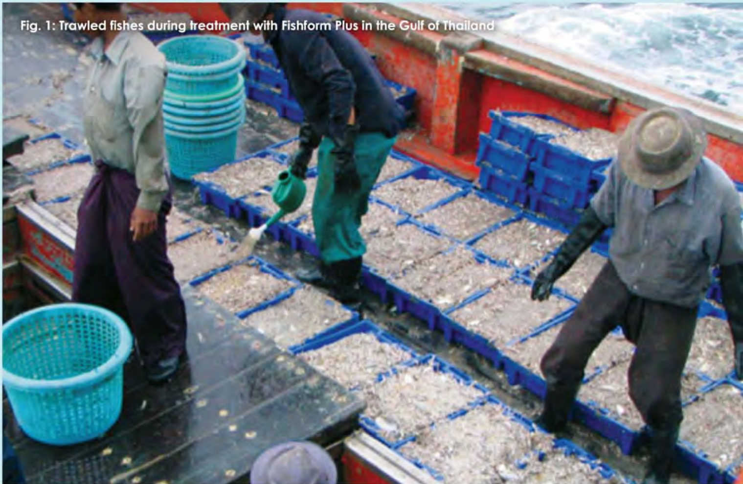
Fig. 1: Trawled fishes during treatment with Fishform Plus in the Gulf of Thailand

TVN is often used as a criterion for the freshness of fish raw material (Haaland and Njaa, 1987). This value in the fish before processing is known as the most important quality criteria for raw industrial fish and the fishermen is paid according to the measured TVN level when landing the catch at the fishmeal factories. The main constituents of TVN are trimethylamine and ammonia. Its amount increases with time of storage in the unfrozen state. Trimethylamine originates from bacterial decomposition, and the presence in fish is therefore taken as an indication for bacterial growth, while the ammonia comes from decomposition of amino acids – thus reducing the quality of the available protein. Levels of mainly 40 mg TVN per 100 g fish mass are regarded by the industry as limits for a good quality fish meal for instance. Furthermore biogenic amines, like Histamine (Hist.), are formed if the bacterial degradation of protein (amino acids) has started and is therefore an important criterion for the quality of the